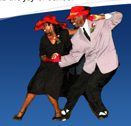
A photo from CADE's recently produced "The History of Black Dance in America

influenced by African dance and were shaped by spirituality and slavery. We aim to express the infectious healing qualities of dance, to educate audiences and to spread the joy of dance.